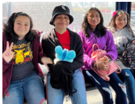
Navy Pier gratefully acknowledges Cboe and their generous support of the Community Rides Program.