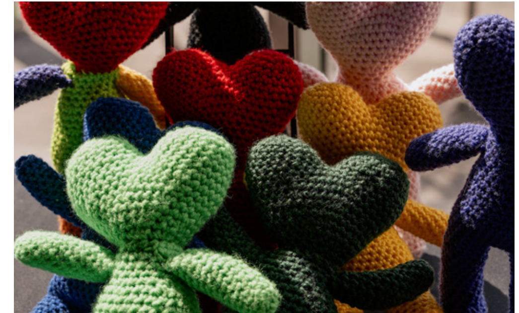
A featured business at Navy Pier's Local Soul kiosk, CommunityCorey's Hearthelds(TM) can be found for sale as a guests enter the Pier.