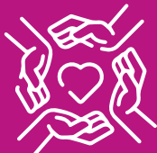
Equity & Work Culture