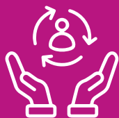
Recruitment & Retention