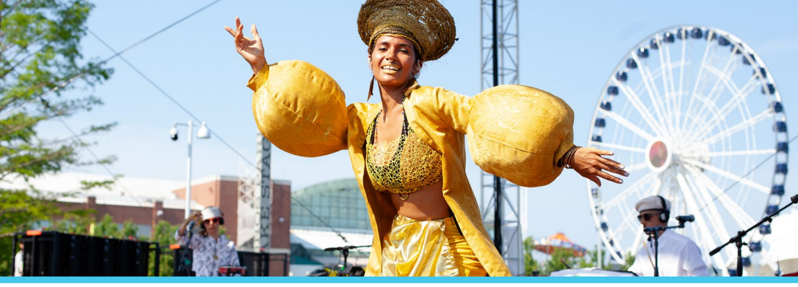
LatinXt Music Festival