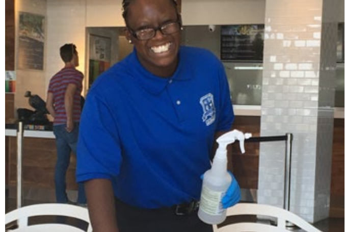
Navy Pier is home to a classroom for Southside Occupational Academy, where students with special needs develop employable skills.

The new Sable Hotel , named for a Naval aircraft carrier stationed at the Pier during WWII, opened to acclaim in March. The long-planned luxury hotel, the 100<sup>th</sup> property of the Curio Collection by Hilton, boasts 223 rooms with floor-to-ceiling views of the lake, as well as 4,300 feet of new meeting and event space. Offshore rooftop bar is now home to the world's largest rooftop venue, as noted by the Guinness Book of World Records.