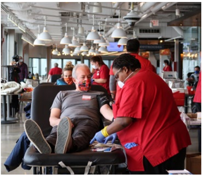
Despite closure, Navy Pier hosts American Red Cross Blood Drive.

While activity at the Pier may have come to a halt, staff immediately turned to planning a safe reopening and launched virtual programming to bring the excitement of Navy Pier into guests' homes. Within weeks, live performances by Chicago's top DJs and interviews with beloved local musicians were streaming live in homes across the country. At the same time, the facility's