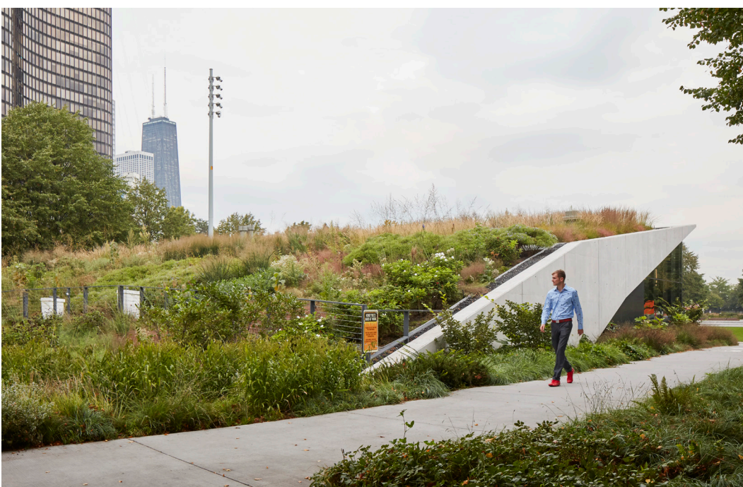
The Welcome Pavilion's green roof showcases plants and flowers native to the Midwest and hosts two active beehives.

Located in Polk Bros Park and built with sustainability in mind, the eco-friendly Peoples Energy Welcome Pavilion is a 4,000-square foot facility designed to welcome guests and offer a variety of information as they arrive and navigate the Pier. It features a 35-foot, state-of-the-art digital screen, which displays an overview of Navy Pier, Peoples Gas, and Chicago's shared histories, as well as sustainability facts and welcome greetings in various languages to honor the nearly 9 million diverse guests who visit the Pier annually.