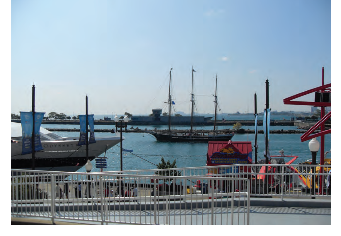
Excellent water access for both boaters and visitors is essential in any redevelopment plans for Navy Pier.